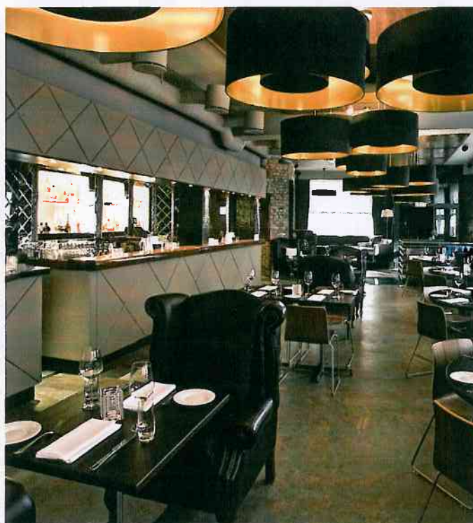
A fusion of British, Italian and Norwegian influences.